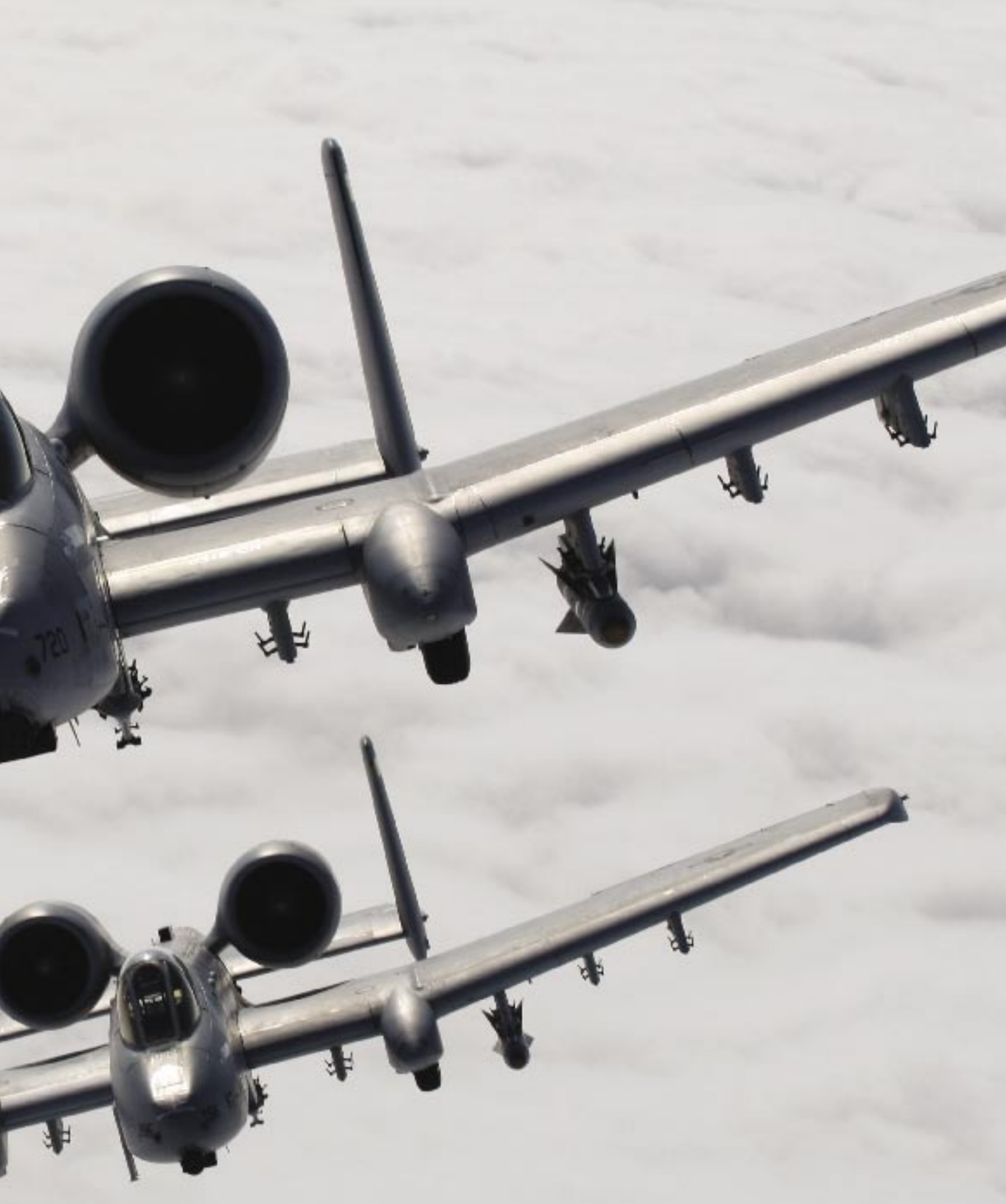
A brace of A-10Cs—the latest, most powerful Warthogs yet—skims the cloud tops over Maryland.