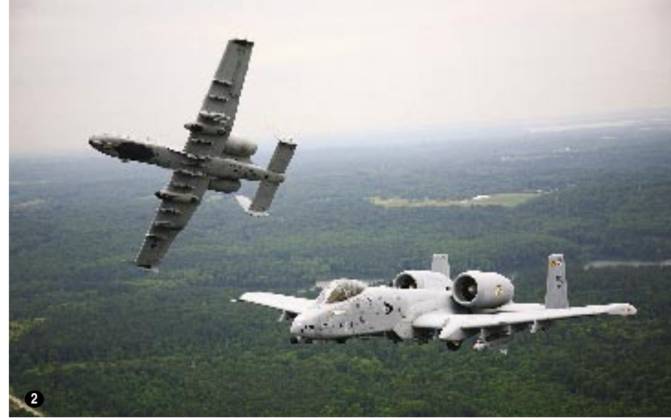
|1| Lt. Col. Jim Tillie runs cockpit checks before a mission. "Boomhauer," the fast-talking character from TV's "King of the Hill" cartoon, graces the access ladder door. |2| A sharp pullup over Maryland's Eastern Shore. |3| Originally spec'd for 8,000 hours, most A-10s have already reached that milestone. The A-10C model first flew in January 2005, and the Maryland Air Guard got its first improved air frame in August 2006.