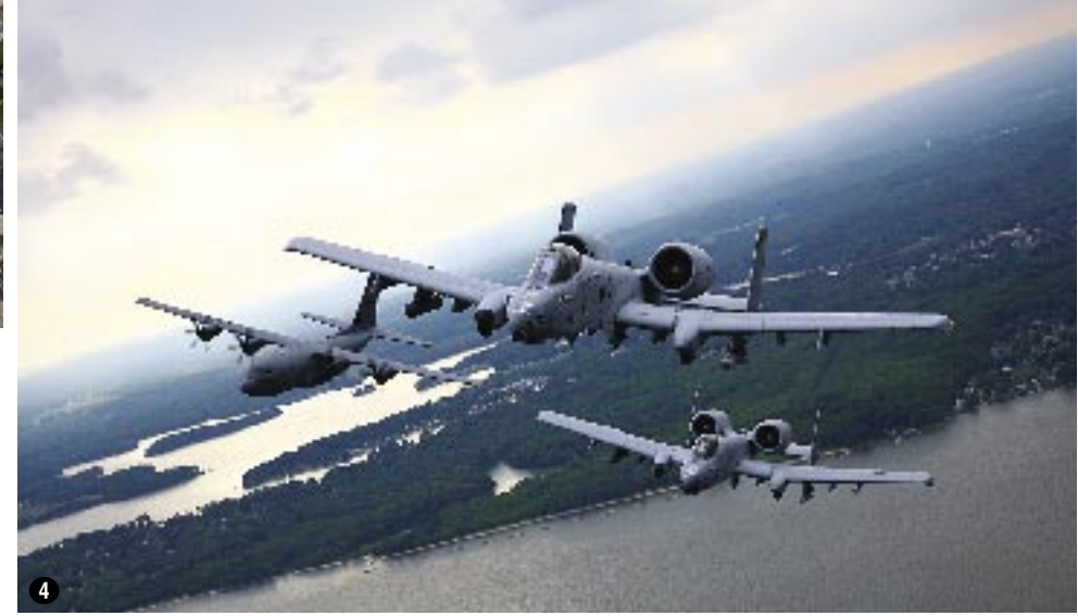
[3] Crew chiefs prep a Hog at Martin State Airport near Baltimore, home of the 175th. [4] The 135th AS C-130J forms up on two of the 175th's A-10Cs.