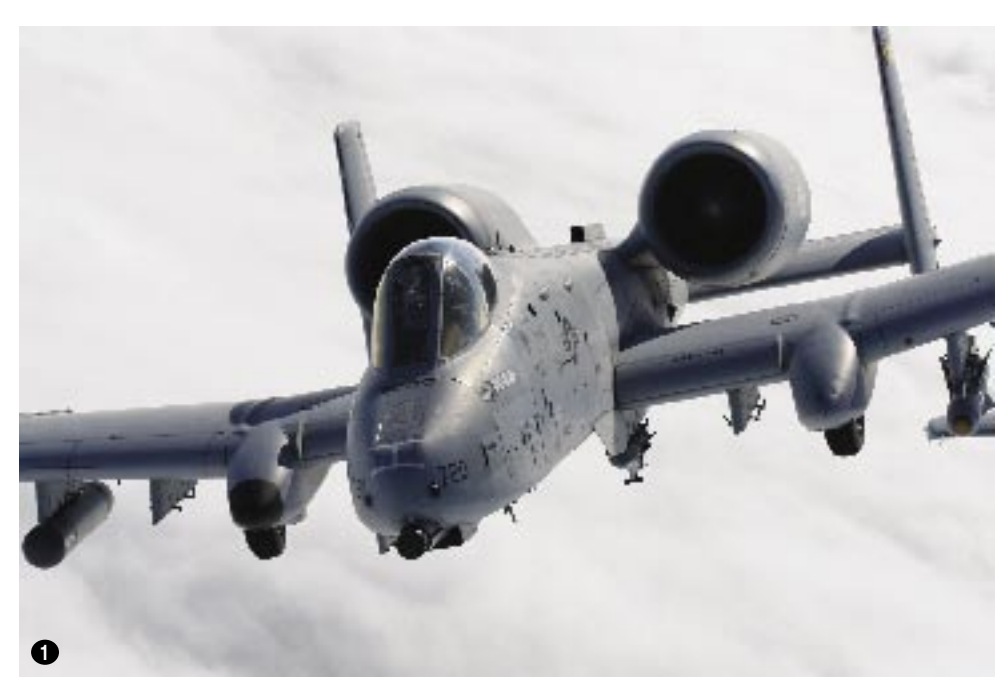
THE A-10C is the product of the precision engagement upgrade to the standard A-10. The digital upgrade gives the Warthog the ability to use the latest precision weapons, plus up-to-date navigation, communications, and displays. [1] An A-10C of the Maryland Air National Guard's 175th Wing shows off its 30 mm cannon. [2] Two uprated Hogs zoom in from the Chesapeake Bay followed by a Maryland ANG C-130J of the 135th Airlift Squadron.