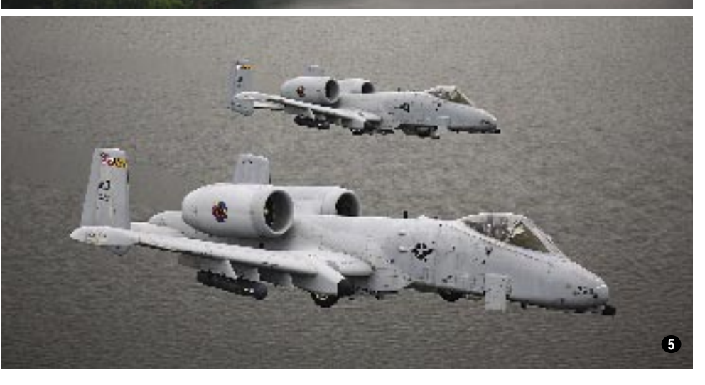
|1| A-10s and a new C-130J of Maryland's Air Guard fly over the Chesapeake Bay Bridge. |2| Two A-10Cs show off their self-defense capability: AIM-9 Sidewinder airto-air missiles.|3| Besides the precision engagement upgrade, 242 A-10s will also get brand-new wings. The two upgrade packages should keep the Warthog in service through 2028. |4| A Hog driver presents a salute. First flown in 1972, the A-10 promises to be one tough-fighting bird past its 55th birthday. |5| Designed to thwart hordes of Soviet armor, the A-10 has earned its battle stars against the Iraqi Republican Guard and the Taliban of Afghanistan.