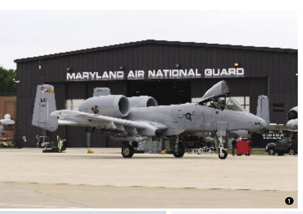
|1| The Maryland ANG's 104th Fighter Squadron not only was the first unit to be equipped with the upgraded A-10s, but it helped field the improvements package. The squadron worked closely with the 422nd Test and Evaluation Squadron from Nellis AFB, Nev., to perfect the upgrade. |2| The A-10's weapons repertoire now includes virtually every tactical weapon in the USAF inventory. A Maverick missile is carried here on a training sortie. |3| The A-10's fearsome 30 mm gun has been used extensively in Afghanistan, providing the precise close air support for which the aircraft was originally designed.